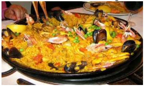
Delicious Paella, Salad and Homemade bread