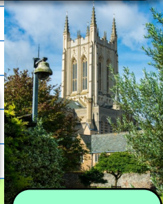
3pm Visit to St Edmundsbury Cathedral