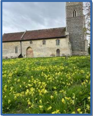
Cowslips in the churchyard